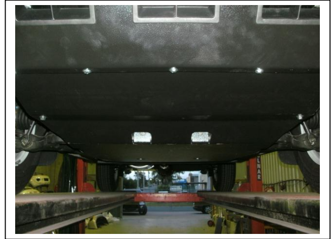
Figure 2: Shown from front